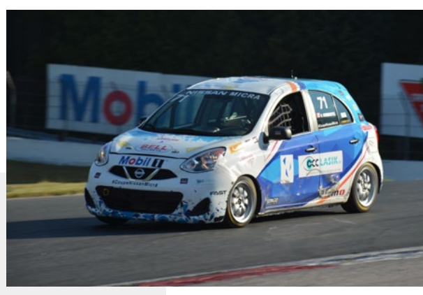
Perfect weekend for Nicholas Hornbostel in the Micra class: two wins, two pole positions and two fastest laps!